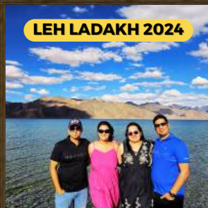
LEH LADAKH 2024