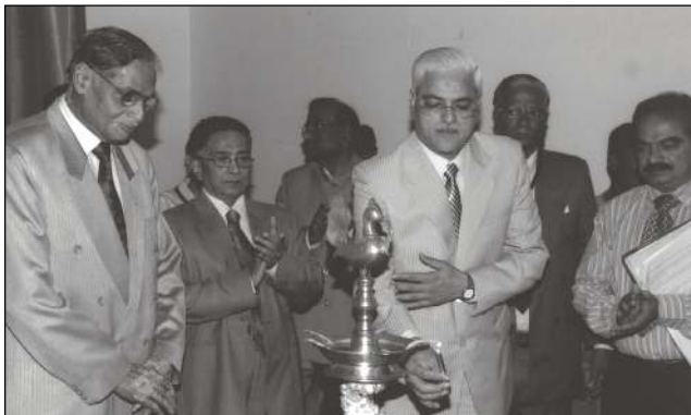
Hon'ble Chief Justice Mr. Anil R. Dave, High Court of AP inaugurating the National Tax Conference-2008, Hyderabad by Lighting of lamp.