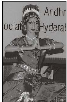
Cultural Programs conducted during the National Tax Conference, 2008 at Hotel The Manohar, Hyderabad.