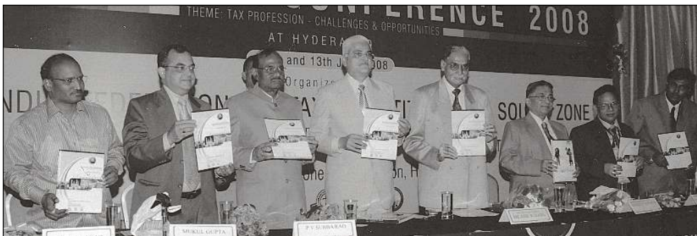
Hon'ble Chief Justice Mr. Anil R Dave, High Court of AP releasing the "National Tax Conference-2008, Souvenir."